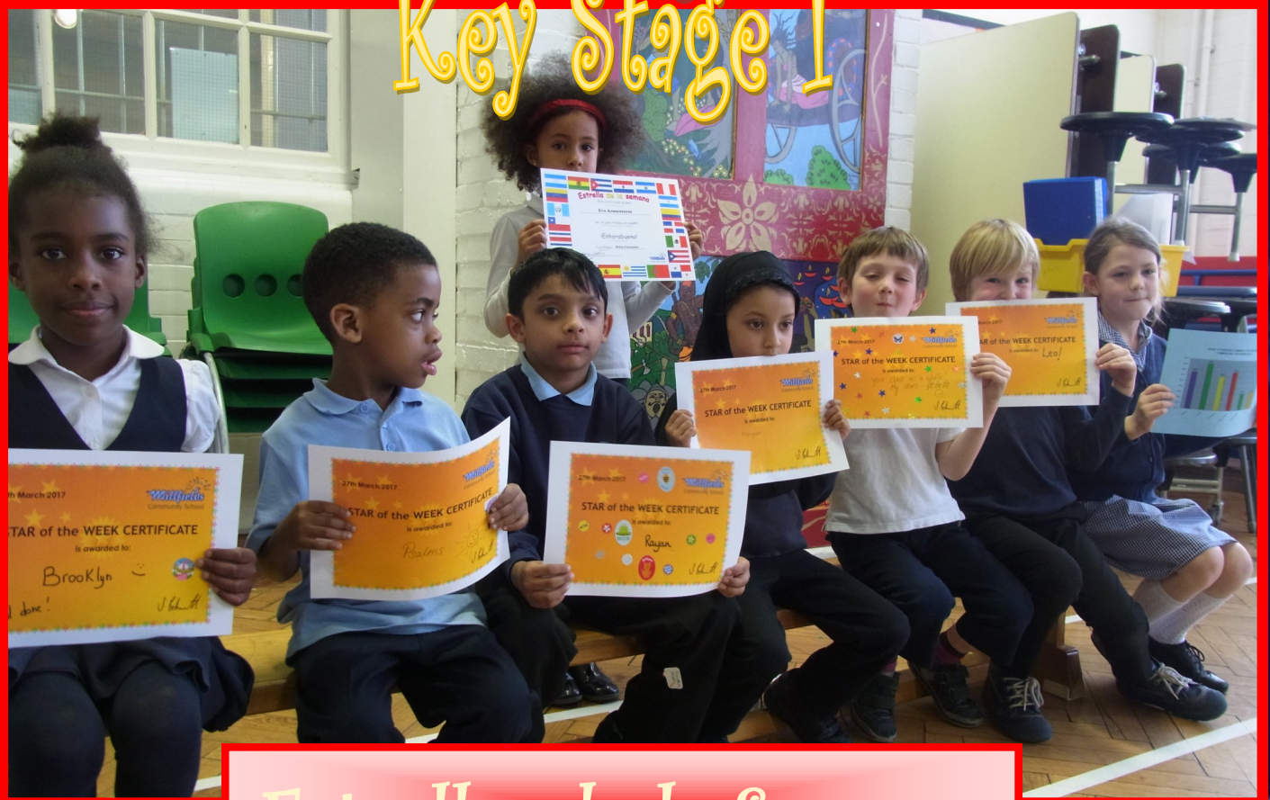
Estrellas de la Semana